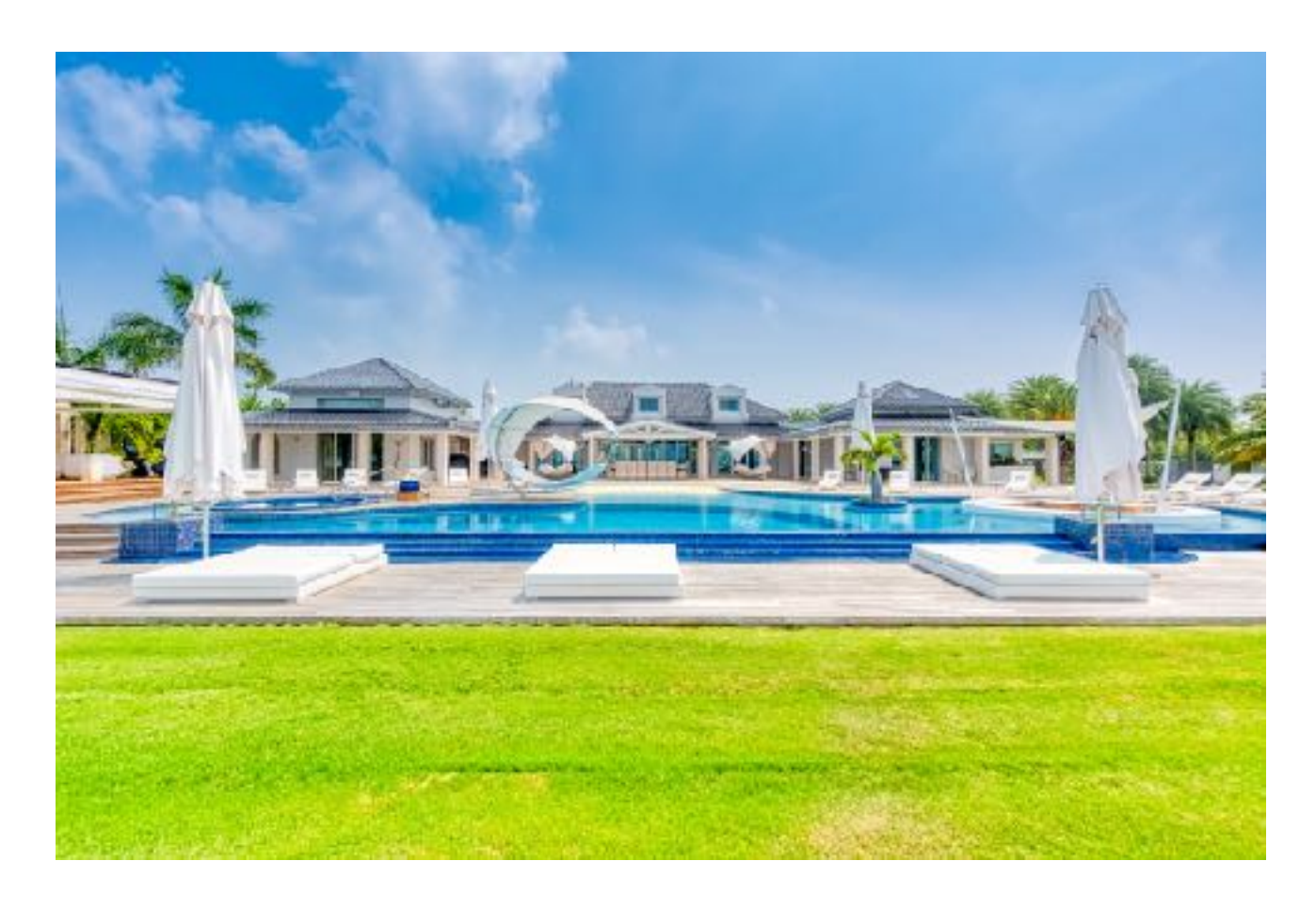
Villa C'est La Vie | 6 BR | St Martin Villas | Haute Retreats