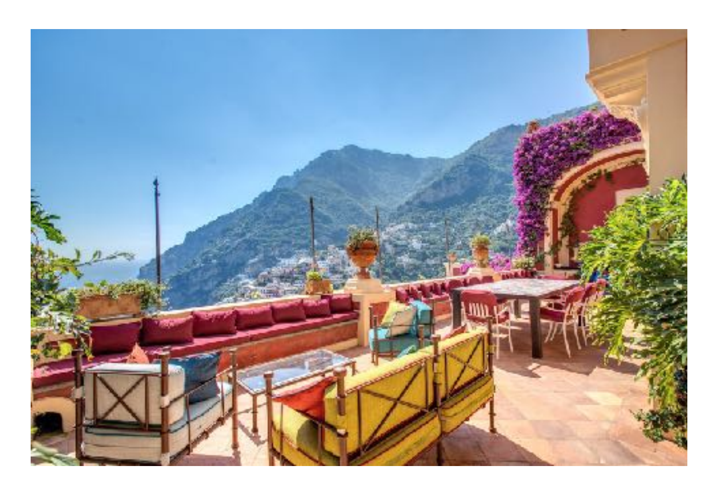
Palazzo Santa Croce I Amalfi Coast Villas I Haute Retreats