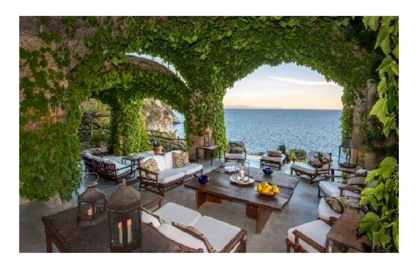
Villa Alfresco in Amalfi Coast I Italian Villas I Haute Retreats